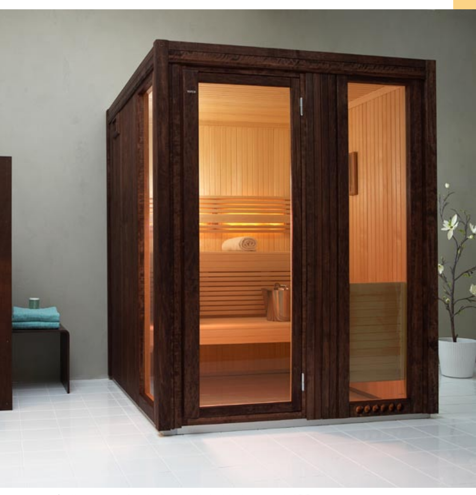
Grand Luxe sauna room with outside walls in a stained finish and glazed sections 52 and 52 VENT.